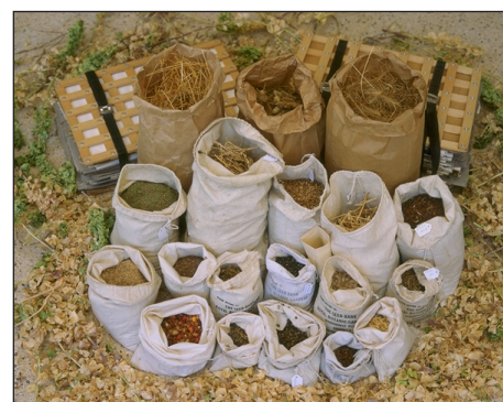
Right: Seed collections in cloth / paper bags

Place collections of dry, ripe seed into cloth or paper bags for transit. Store any awned seed or hooked fruit, that would damage or get stuck in cotton bags, in cardboard boxes or strong paper bags. Never collect or store seeds in plastic bags. Label all seed containers inside and out with a unique collection number, and seal them securely. It is best to prepare sufficient labels before filling the containers.